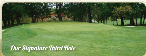
Our Signature Third Hole